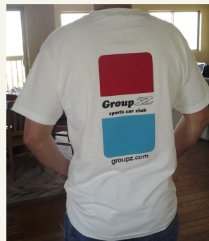
Ain't it purdy...only fi'teen American dolla's

What better way to show off the pride of the oldest Z club in the USA and arguably the world than by wearing your colors proudly at all car club events, weddings, exhumations and other fun summer stuff