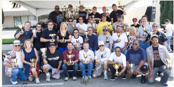
The WCN 2012 Winner'Z

There may be others of you that are celebrating this joyous occasion but Group Z does not have that information from you. If you wish to be recognized on your special day let one of our club directors know so that you can be added to the list.