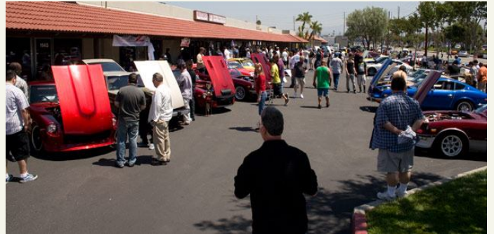
Sunday MSA Show

There may be others of you that are celebrating this joyous occasion but Group Z does not have that information from you. If you wish to be recognized on your special day let one of our club directors know so that you can be added to the list.