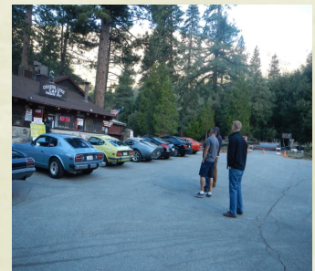
Azusa Canyon to Crystal Lake Run